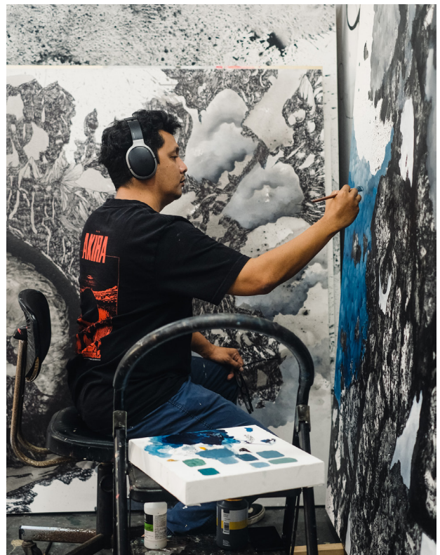
Left: Kemalezedine, Mountain #3 , 2022, ink and acrylic on canvas, 180 x 150cm