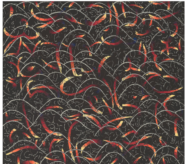
Left: Savanhdy Vongpoothorn, Footsteps to Nigatsu-Do (Interlocked Waves) , 2019, acrylic on perforated canvas, 94 x 104cm Right: Savanhdy Vongpoothorn, The Sea of Fire, the Fire Sutra , 2022, gesso and acrylic on perforated canvas, 94 x 104cm