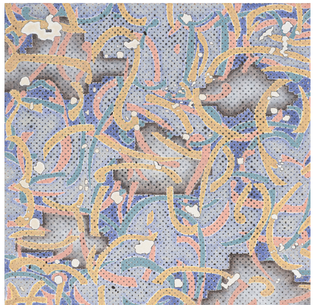
Left: Kemalezedine, Landscape #2 , 2022, ink and acrylic on canvas, 150 x 150cm